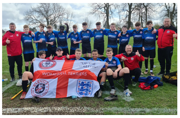
Above: Our U15 boys celebrate their league title.

A massive well done and congratulations to all of our teams on a successful season and good luck next season!